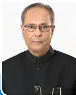
The Visitor of the University Shri Pranab Mukherjee His Excellency, The President of India