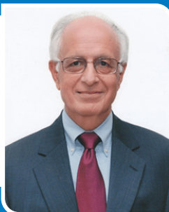
The Chancellor Shri Arun Maira